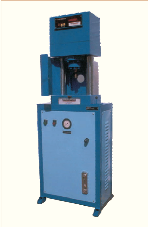
STEEL BALL STRENGTH TESTING MACHINE