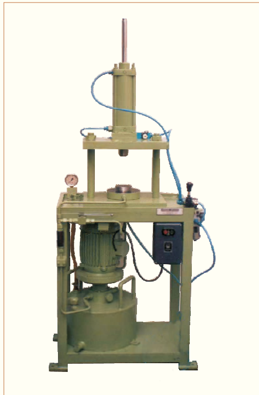
VALVE SEAT LEAKAGE TESTING FOR MAHINDRA TRACTORS

Some of the parameters required for designing a testing machine are application details, test parameters, level of automation required, data acquisition / recording pattern, component drawing, fixture / mounting details. Call on our application engineer he will offer you a machine as per your drawings & needs