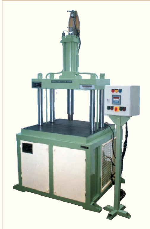
RUBBER BONDING STRENGTH TESTING MACHINE