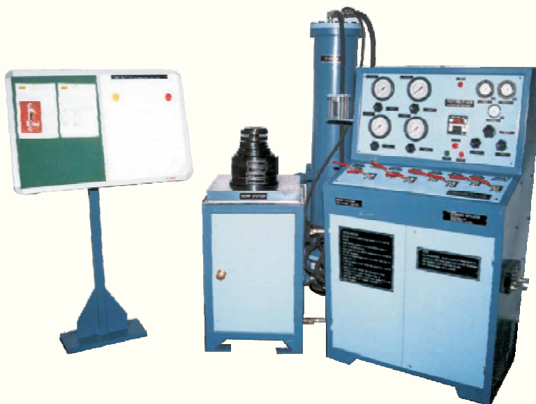
GAS VALVE TEST RIG FOR GAS TRAINING INSTITUTE - GAIL