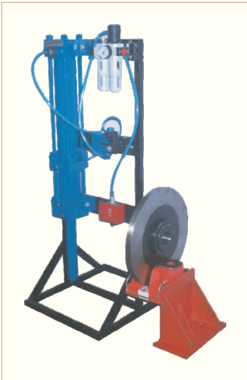
BRAKE LINING TESTING MACHINE